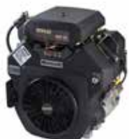
KOHLER 23 HP Command Pro CH680