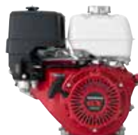
HONDA 13 HP GX390