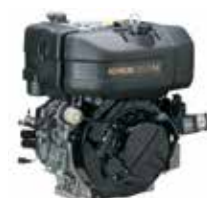
KOHLER 9.1 HP Kohler Diesel KD-440