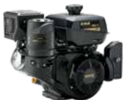
KOHLER 14 HP Command Pro CH440