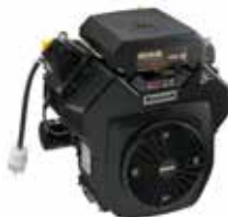
KOHLER 20 HP Command Pro CH640