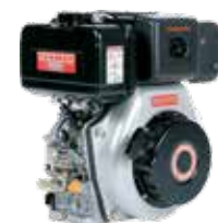
YANMAR 9.1 HP L100V