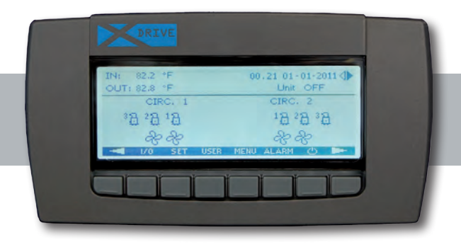
semi-graphic back-lit user interface