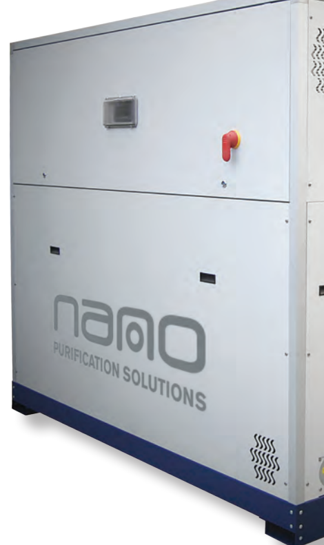
low noise axial fans