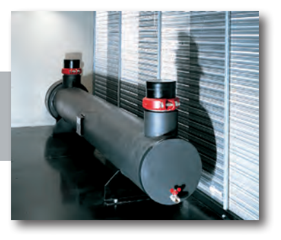
optional shell & tube heat exchanger