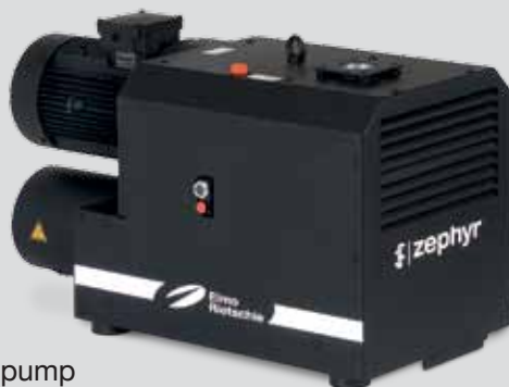
VLR-301 Vacuum pump