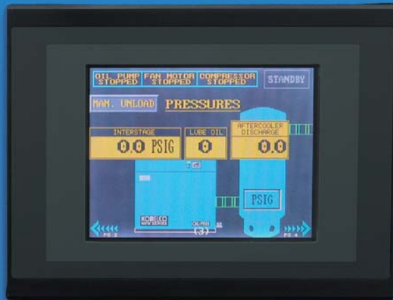
Optional color display.