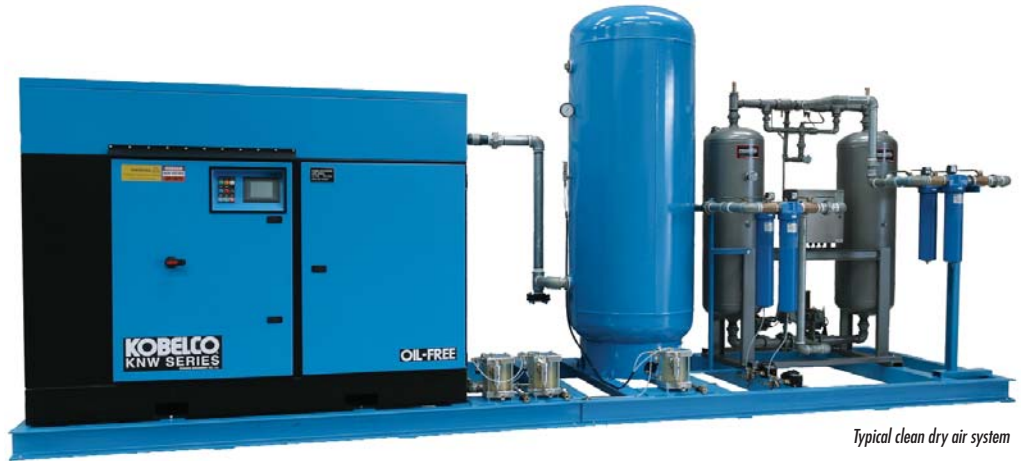
Typical clean dry air system

To meet the demands and preferences of a wide range of customers and industries, we offer custom packaging of compressors, dryers, filters and receivers. From the simple package shown to projects requiring stainless steel welded pipe, Nema 7 controls, or outdoor weather protection, we can supply it. Packaging greatly reduces on site installation costs and the equipment is tested together.