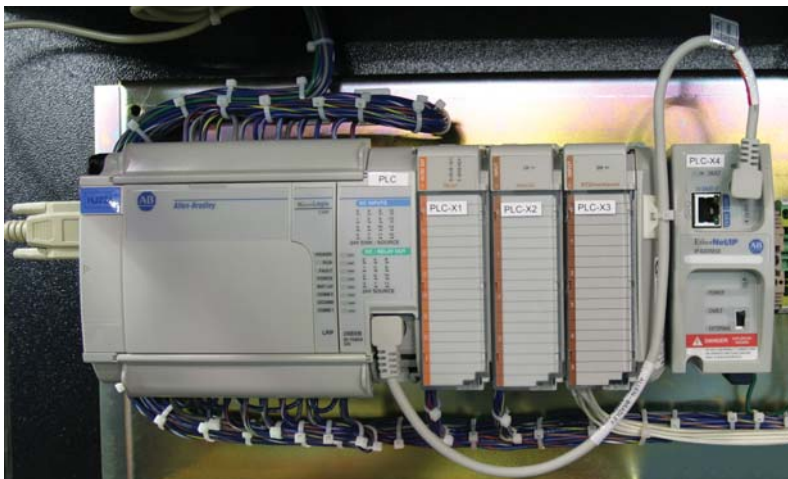
Standard Allen-Bradley PLC. Built in sequencing capability—up to four compressors. Interfacing with plant monitoring systems easily accomplished (optional). (Optional Allen Bradley Ethernet Communication module shown.) PLC manufacturers of customer preference can also be utilized at additional cost.

capacity loss during the life of the unit. A separate motor driven oil pump ensures positive lubrication of all gears and bearings prior to start-up, maximizing component life.