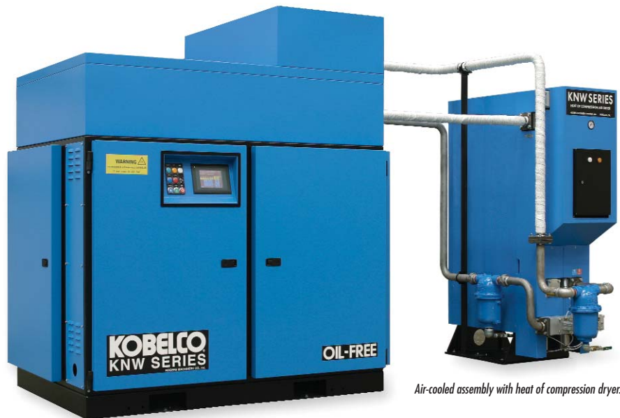
Air-cooled assembly with heat of compression dryer.